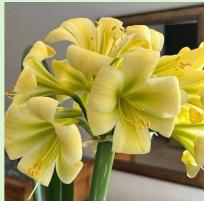
Yel Gr1 GT (Flip)