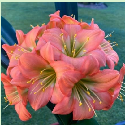
Discovery One x Angelica