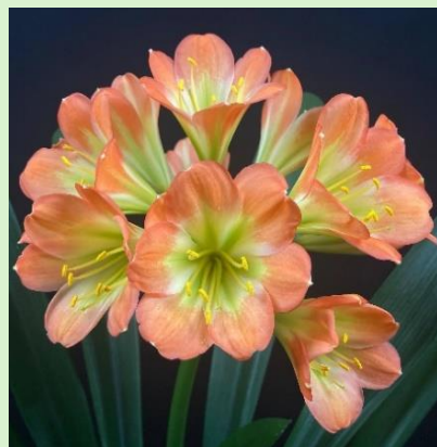
Appleblossom x Angelica