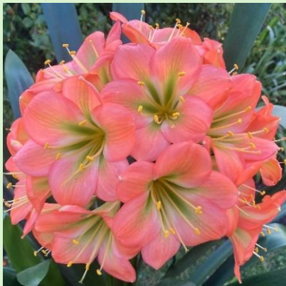
Perfect Face x Angelica