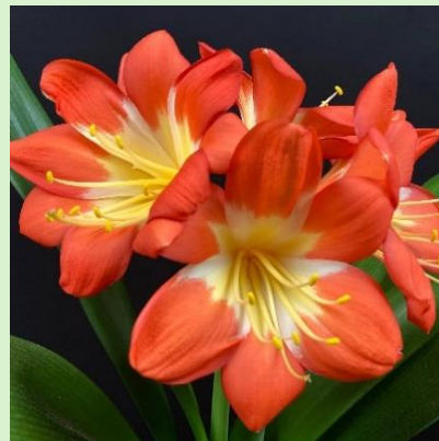
Orange with huge flowers